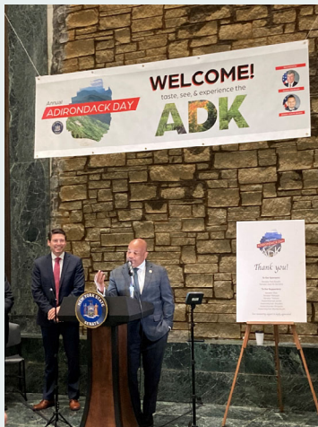
NCA exhibited at Adirondack Days in Albany, May 2024

“The North Country Alliance promotes economic and business growth in New York’s North Country region through collaboration, financing, and advocacy.”-Mission Statement