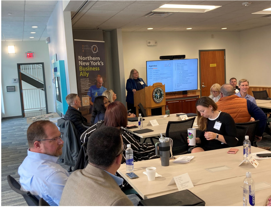
Fall membership meeting at St. Lawrence Seaway Visitor Center, Massena